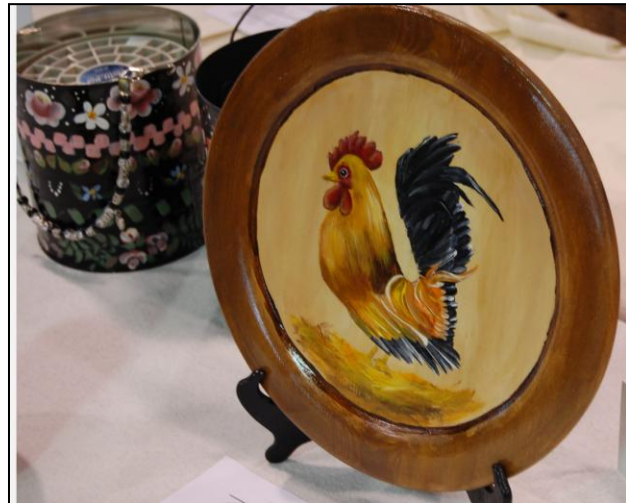
Projects from previous classes.